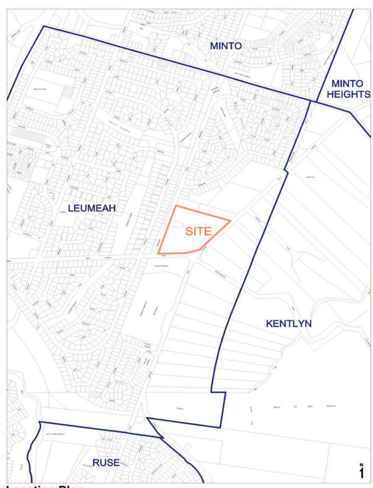
Location Plan Proposed Rezoning of Land - Amundsen Street LEUMEAH